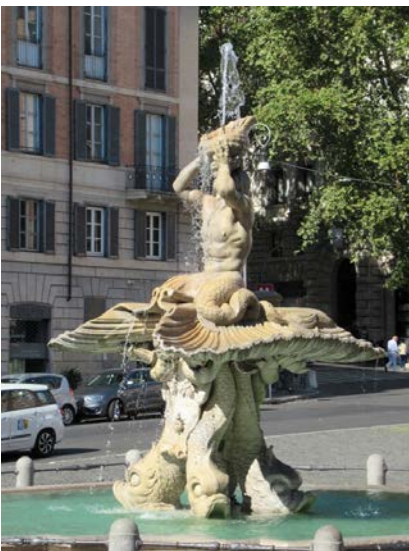
Gian Lorenzo Bernini, Triton Fountain, Rome, 1642-43