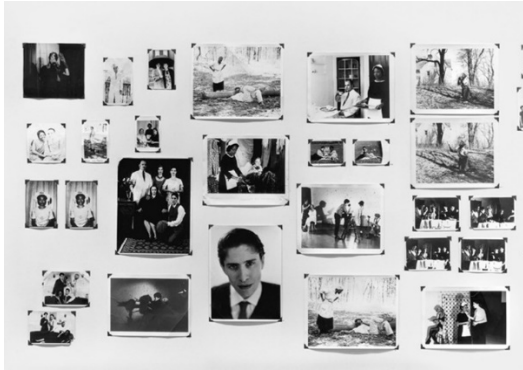
Zoe Leonard, The Fae Richards Photo Archive , 1993-96